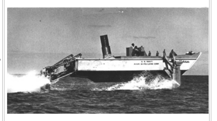
HALOBATES with ACS