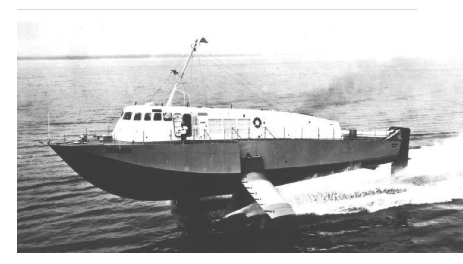
Grumman-Built MARAD Hydrofoil, HS DENISON

we would build a minimum of five hydrofoils if we were granted a license. So MSC was forced to watch from the sidelines as the MARAD program developed.