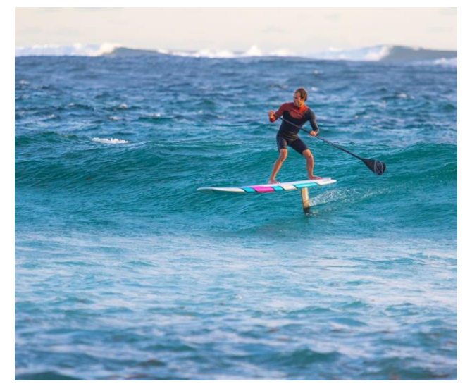
Hydrofoil Stand-Up Paddleboard (SUP)

that strut, as well as be able to influence the wand to maintain control and the ability to turn. You mentioned the foiler moth, it is a good example. The foil on the keel provides lift, balance and sail handles roll. The controllable foil on the rudder controls yaw, pitch, and height above the water. Steer with the tiller, and turn the handle on it to control pitch/height above water. If you don't mind having some kind of 2 axis tiller on your SUP board, you could add a wand for added stability