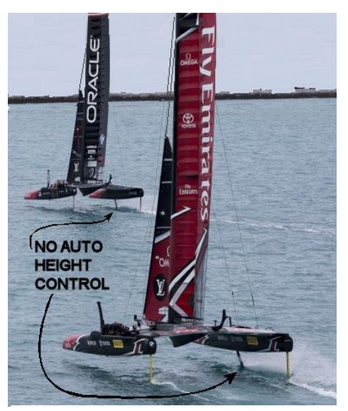
AC50 photo credit: https://www.americascup.com/en/history.html

sail trim, wing shape, jib trim, rudder, and main foils -- commonly called dagger boards. The Kiwi's cycling allowed the entire 6-man team to better conceal themselves in the upwind hull. They did not sit up, hike-out, or otherwise extend their bodies outside the enclosure, a common practice used by sailors including the two Oracle team members seated most aft on the outer edge of the hull. By using legpower, three cyclists could match the horsepower requiring four traditional arm-powered grinders. An early impression was that the pedalers were modeled in the fashion of high performances bicycle riders: big thighs, compact Perhaps like champion bodies. Lance Armstrong who bikes on land at 160 lbs. The American's team, who were in fact all from Australia except one from the UK, appeared to weigh more due to upper body In fact, here are two proportions. examples to demonstrate equality of Grinder Kyle the two teams. Langford weights 198 lbs, but