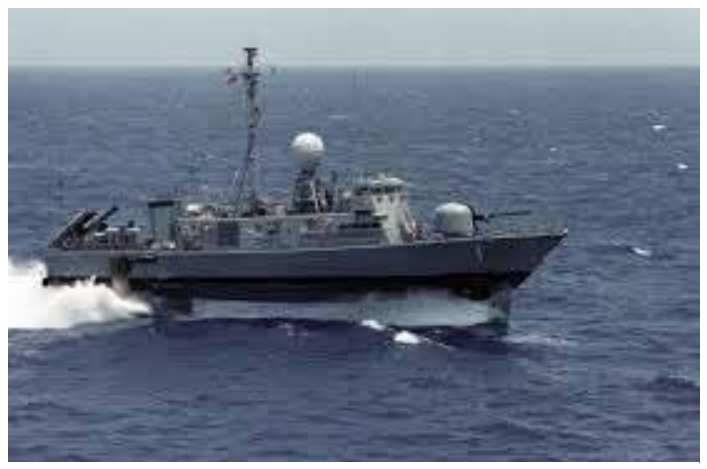
The Boeing developed and built hydrofoil missile boat USS Pegasus.

Boeing, however, spread its significant development costs over the civilian version, the 43 knot Jetfoil, of which they built 28. Fifteen were subsequently built under licence by Kawasaki in Japan and two built in China but styled slightly differently. Interestingly, after a hiatus of 25 years, Kawasaki launched another example earlier this year.