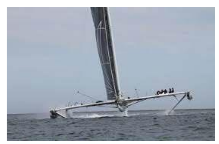
In 2009 the large foiling trimaran l'Hydroptere achieved 51 knots over a measured nautical mile. It actually exceeded 55 knots during the speed attempt.

These hydrofoil sailing boats are doing everything we want in ferries, patrol and other commercial and military vessels. Strong, lightweight, low resistance boats require less power and less fuel while giving a smoother ride and making less wash. Jetfoils, for example, offer a wonderful ride and high speed but wouldn't it be great if you could achieve that with significantly less power? I'm sure it will happen before long.