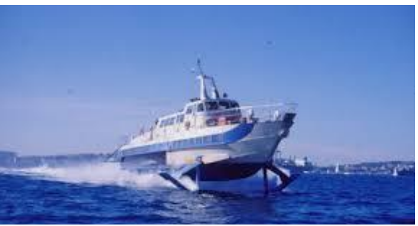
An early Rodriquez RHS 140 'Curl Curl' on Sydney Harbour.

It was disappointing, even though I could understand why, that the hydrofoils began to be withdrawn from service from 1988. Unaffordable fuel costs were blamed. I was no longer living in Sydney then but visited frequently and maintained my interest in the hydrofoil ferries. It was interesting to investigate why they were withdrawn and, mostly, scrapped after only just over 20 years. It seemed sad for aluminium craft to be so readily discarded. Fuel costs were a problem as were their berthing peculiarities and the vulnerability of their foils. I suspect, too, that their steel foils connected to riveted aluminium hulls may have suffered from corrosion problems. And, as so often happens around the Australian waterfront, there were union difficulties.