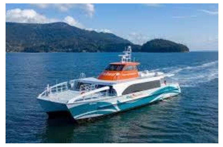
A Teknicraft Design hydrofoil assisted catamaran ferry built in the USA