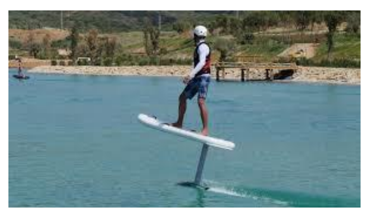
How long before this electric hydrofoil technology will be transferred to the commercial world?

Apart from the very highly developed foil shapes, it is obvious, even to a non-naval architect, that much of the advance is due to the use of modern FRP based materials. Basically, they are incredibly light and strong and, so, encourage hydrofoil development. How I wish I had them back in the mid-sixties!