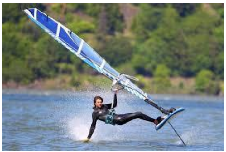
Foiling windsurfers show clearly how little power is required to get them flying.

I confidently expect such a transfer of hydrofoil technology from the leisure to the commercial and military sectors. There will, I am sure, be many more foiling ferries, water taxis, patrol, assault, pilot and other craft over the next few years. They will undoubtedly incorporate those light strong foils. I expect to see and experience many of them and look forward to that. However, the keynote address at your 75<sup>th</sup> IHS Symposium will be really fascinating. I'm sorry I'm unlikely to be here long enough to participate.