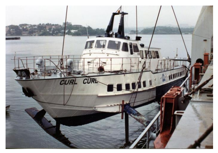
'Curl Curl' being loaded onto Regina in Sydney for shipment back to Italy in February 1992.