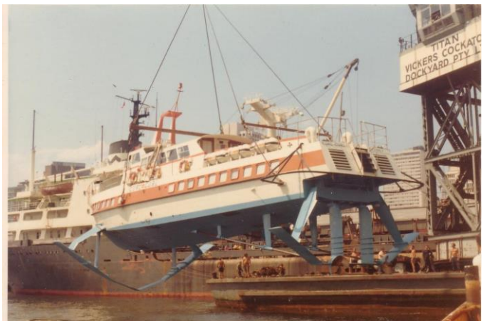
Curl Curl' being unloaded following arrival in Sydney from Italy.

'Curl Curl' was shipped to its original operator, the Port Jackson and Manly Steamship Company in Sydney where it commenced operations in April 1973. 'Curl Curl' continued to operate on Sydney harbour until 1991 but was then sold and shipped back to Italy along with the three other remaining hydrofoils in February 1992. Thereafter, 'Curl Curl' was renamed 'Spargi' and operated with Ustica Lines from 1995 and