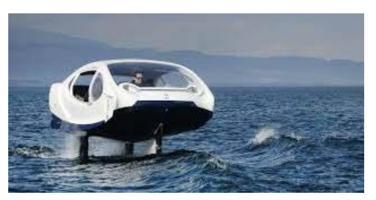
An interesting "fully integrated" electric hydrofoil 'Sea Bubbles' water taxi service launched recently in Switzerland, the home of commercial hydrofoils.

I confidently expect such a transfer of hydrofoil technology from the leisure to the commercial and military sectors. There will, I am sure, be many more foiling ferries, water taxis, patrol, assault, pilot and other craft over the next few years. They will undoubtedly incorporate those light strong foils. I expect to see and experience many of them and look forward to that. However, the keynote address at your 75<sup>th</sup> IHS Symposium will be really fascinating. I'm sorry I'm unlikely to be here long enough to participate.