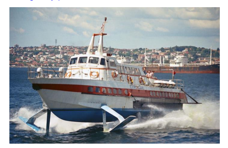
'Curl Curl' operating on Sydney Harbour in 1973.