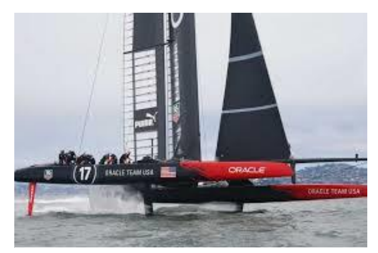
The foiling catamarans competing in the last couple of Americas Cups were routinely flying around the course at 40+ knots.

Of course, these developments apply almost solely to racing boats but, as with Formula One racing cars, plenty of them eventually transfer to normal road cars. I suspect this will happen, also, with boats. Indeed, I expect that ultimately much of what is happening in top level yacht racing will eventually trickle through to engine powered commercial and military vessels.