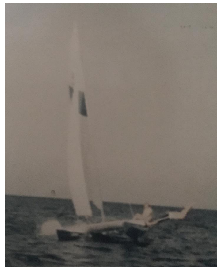
My Attunga Class catamaran flying but not foiling in 1964.

Peter was something of a kindred spirit and mentor who inspired me at that young age to follow the Amateur Yacht Research Society. I devoured its publications, always looking for ways to make my boat go faster. While hydrofoil craft had been around, at least since Alexander Graham Bell's amazing contraption of the early 1900s, they were only starting to become commercialised and weaponised in the mid to late fifties in Switzerland, Italy, Russia, USA and Canada.