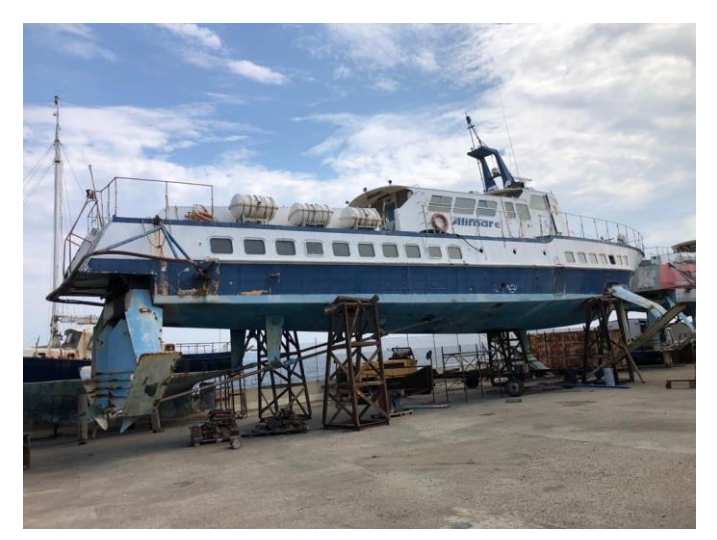
In current condition as 'Spargi' at a ship repair and storage yard in Messina, Italy.